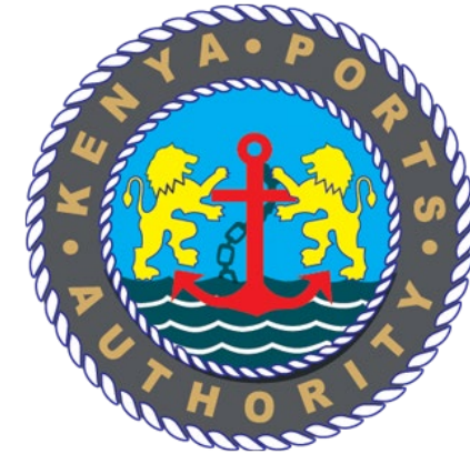
Kenya Ports Authority (KPA)